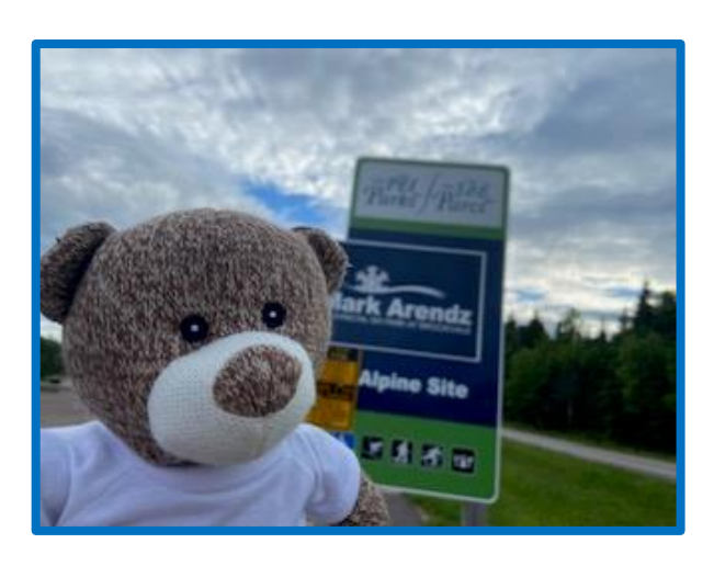
No snow, no go!