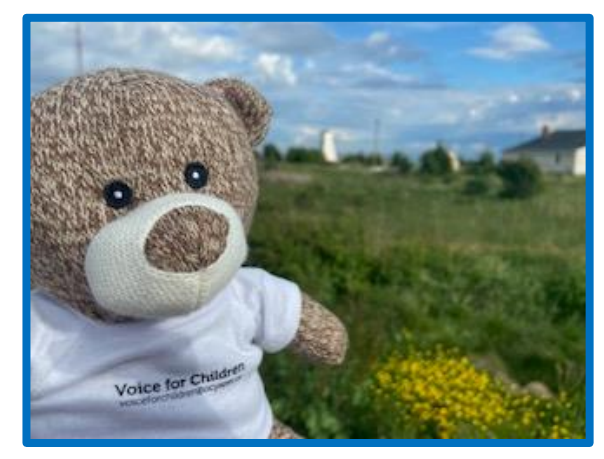
Port Borden Front Range Lighthouse

too far for my little paws so I viewed from a distance