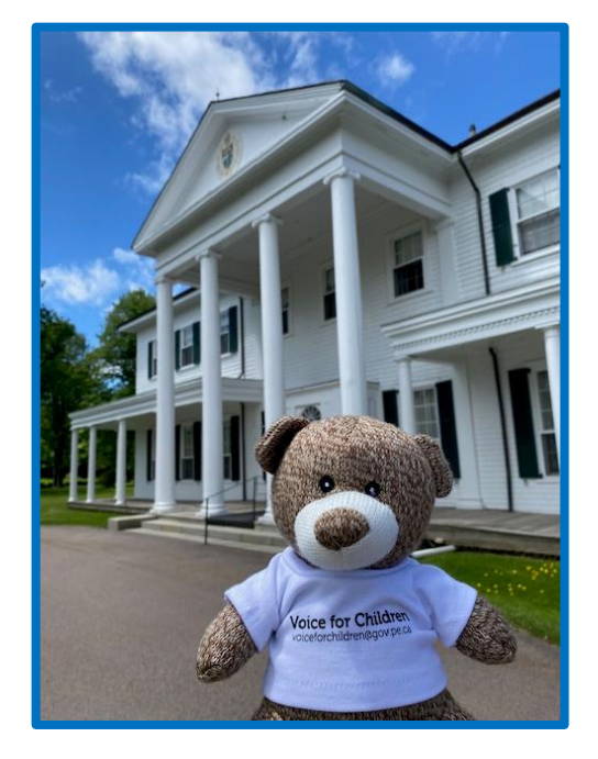
Government House I kind of expected to be invited in for some tea.