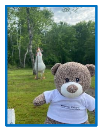
So we returned a second time....things went better.