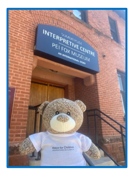
Fox Museum Hmmm...and why not a bear museum?