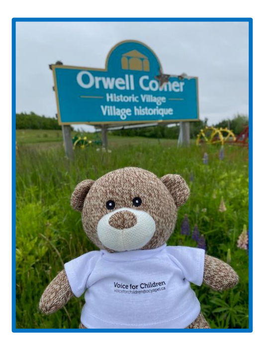
O is for: